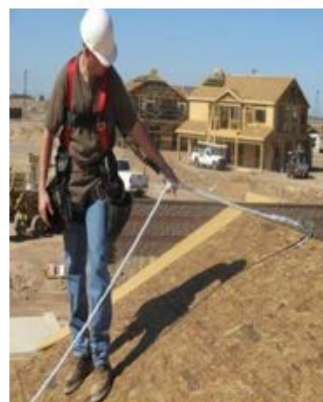
Personal Fall Arrest System