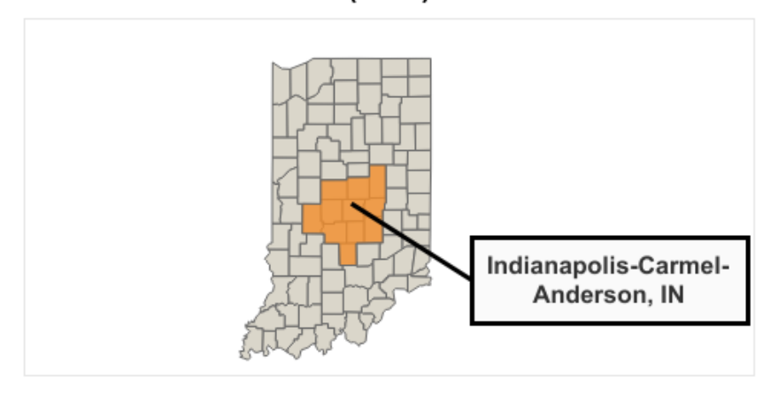
Figure 4- MSAs with the Highest National & Regional (500+ Closings) Builders Market Share (2021)

Analyzing the bottom MSAs, Kansas City, MO-KS had the lowest national & regional builder market share at 10.0%, followed by El Paso, TX at 15.2%.