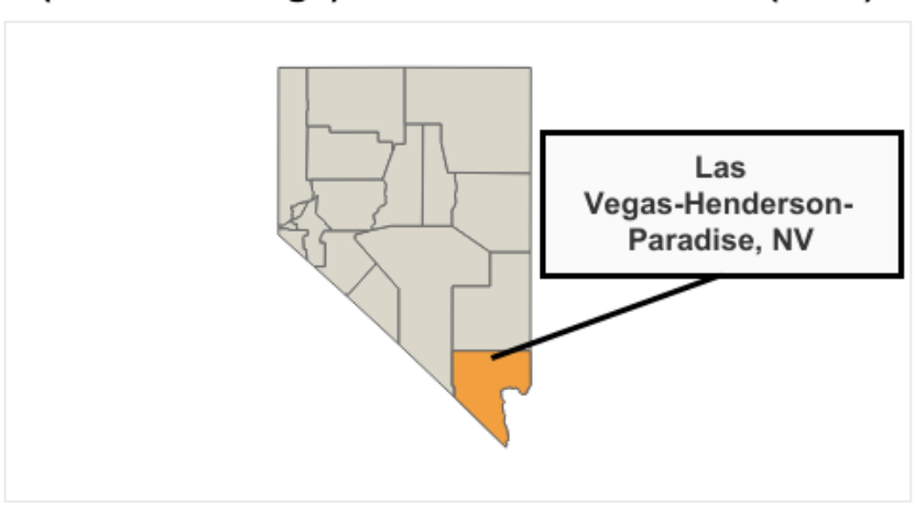
Figure 2- MSAs with the Highest Large National (3000+ Closings) Builders Market Share (2021)

Analyzing the bottom MSAs, Oklahoma City, OK had the lowest large national builder market share at 5.5%, followed by Boise City, ID and Kansas City, MO-KS, both at 10.0%.