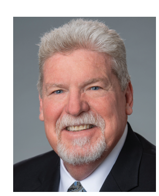
IMMEDIATE PAST CHAIRMAN