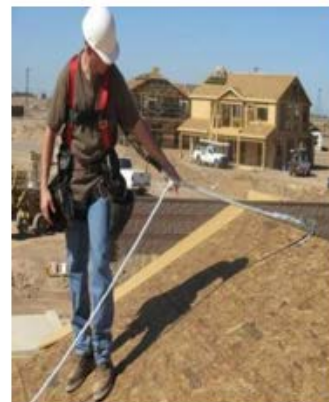
Personal Fall Arrest System