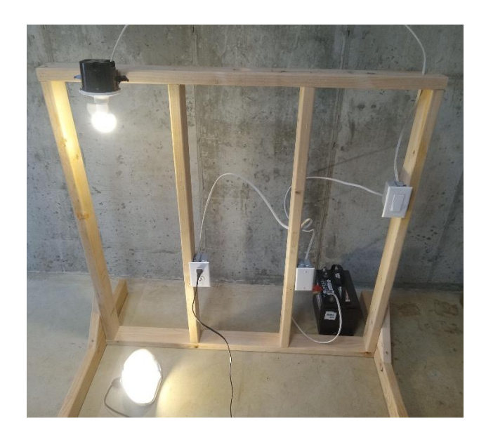
Figure 13. Operational system

Install the light bulb in the light fixture. Turn the light switch on. Plug in the lamp and operate it. Figure 13 shows the operating system.