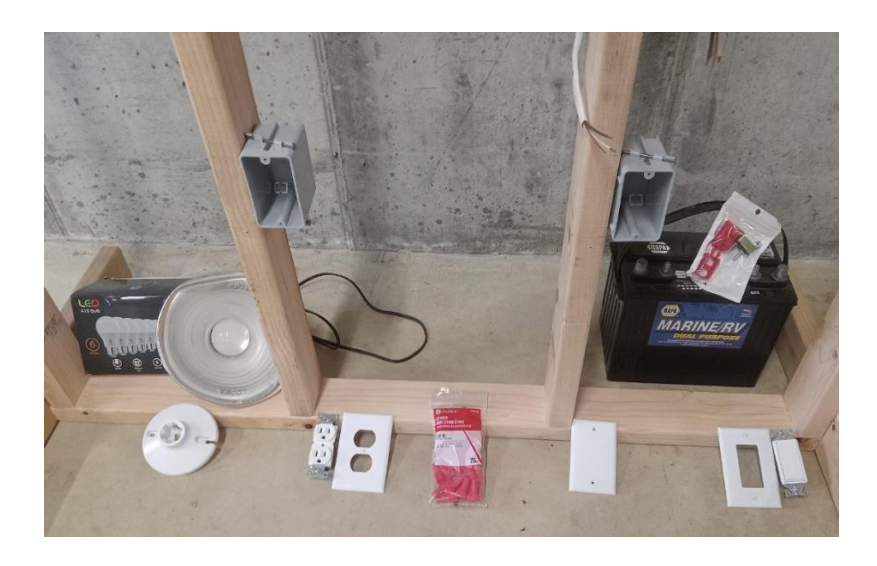
Figure 2. Electrical components

Figure 2 shows the components used for this activity. Note that only an end of one of the 4 cables is shown.