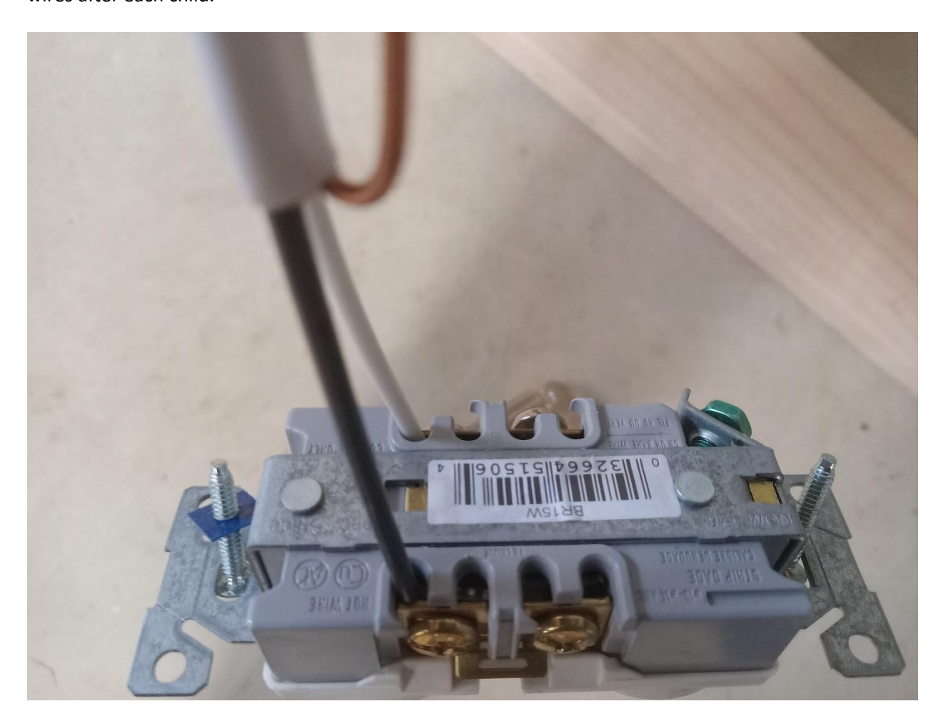
Figure 6. Connect the wiring to the outlet

Starting with the outlet, have the children attach the wires (Figure 6). Connect the black wire to the "HOT WIRE" side, as shown. Have the children simply insert the stripped end of the wire under the compression plate and tighten the screw. Note that the ground wire is bent out of the way. If there are multiple children in the group, they will probably all want to practice this so be prepared to remove the wires after each child.