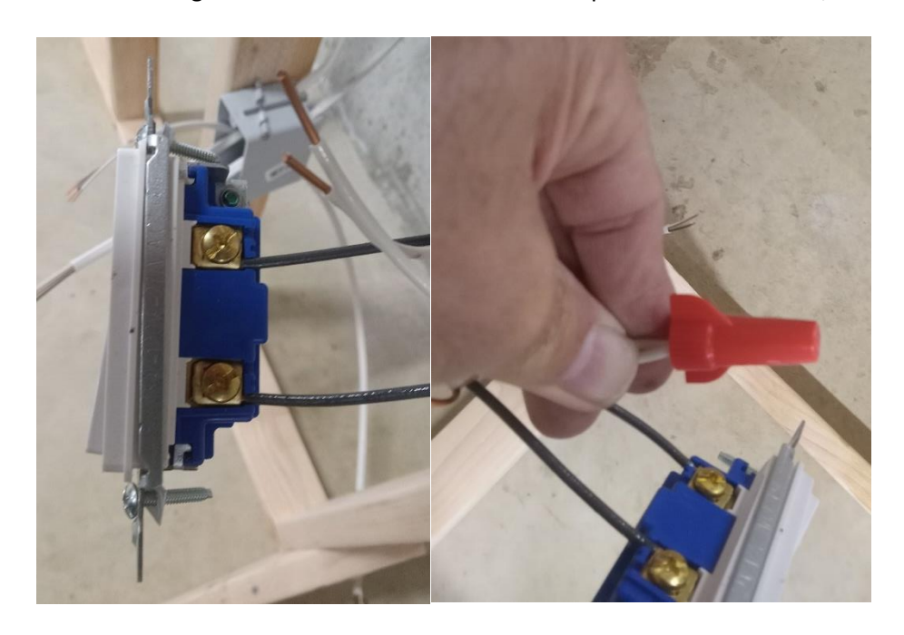
Figure 9. Connect the light switch

Connect the light switch. Have the children attach the two black wires to either side of the switch and connect the white wires using a wire nut (Figure 9). It is not necessary to twist the wires together before installing the wire nut. Attach the light switch to the junction box and secure the cover plate (Figure 10). Ensure that the end of the light switch marked "TOP" is on the top. Assist the children, if necessary.