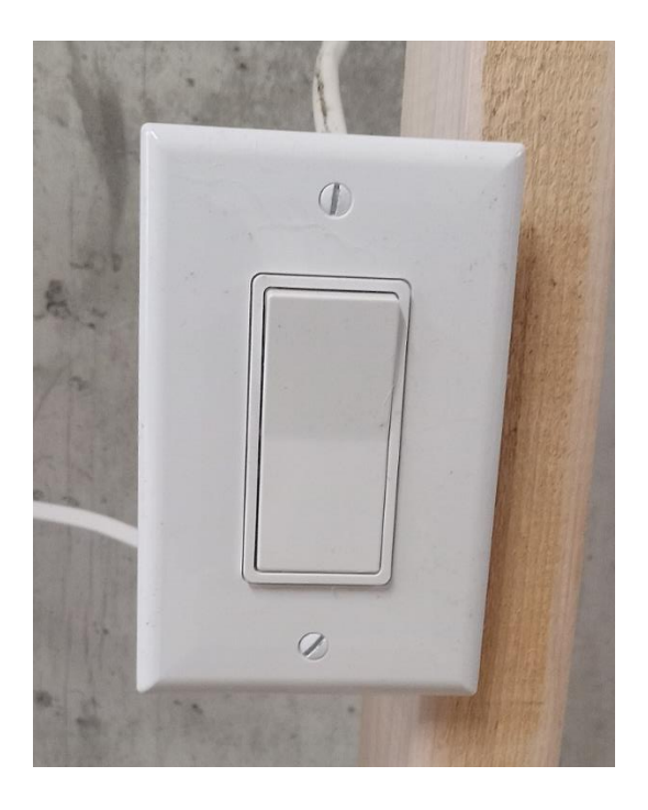
Figure 10. Secure the light switch and cover plate