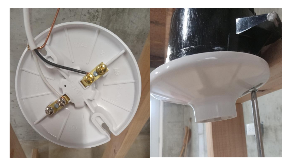
Figure 8. Install the light fixture

Move on to the ceiling light fixture. Strip a total of \frac{3}{4} " insulation from the wires and help the children bend the wires into a hook, if this hasn't already been done. Attach the wires to the screw terminals. Secure the fixture in the junction box (Figure 8). Do not install the light bulb until all wiring in complete to minimize the risk of breaking it.