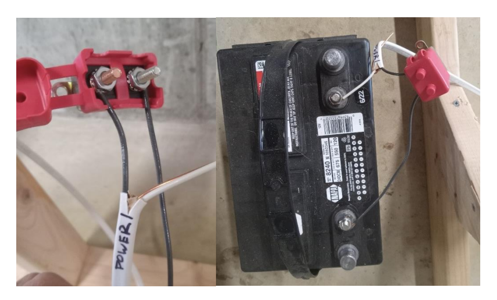
Figure 12. Connect the power supply with circuit breaker

The example uses a lead-acid battery because it was readily available – it is far more powerful than required. The LED light bulbs require 6 watts so only 1 amp is required to power the system. Two general-purpose 6-volt batteries can be wired in series to power the system.