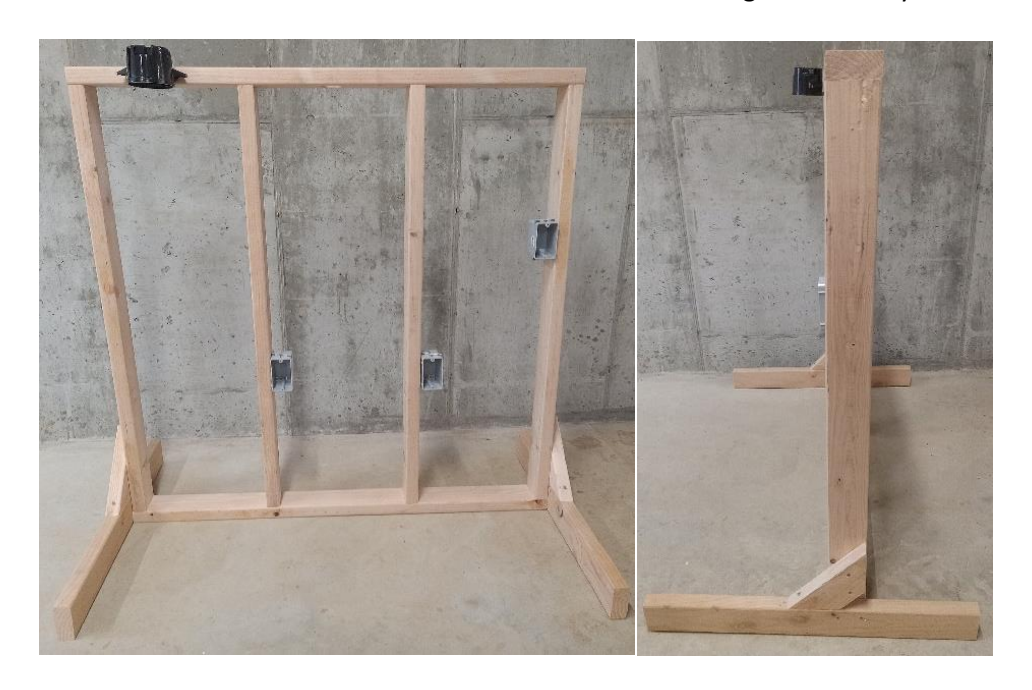
Figure 3. Framed Wall with Junction Boxes

The wall should be prefabricated and carried to the activity location. Construct a 4' \times 4' , 2\times 4 framed wall with 16'' stud spacing. Attach stabilizers to the bottom to hold the wall upright. See Figure 3. The connections may be nailed or screwed. It will be easier to disassemble for storage if the stabilizers are screwed on. Attach junction boxes as shown in Figure 3. Remove punch outs from wire holes. Drill \frac{3}{4}'' holes through the framing, as required, to run wires (see Figure 1). The stabilizers are 30'' long and installed 6'' off-center so that the same wall can be used in the Plumbing Wall Activity.