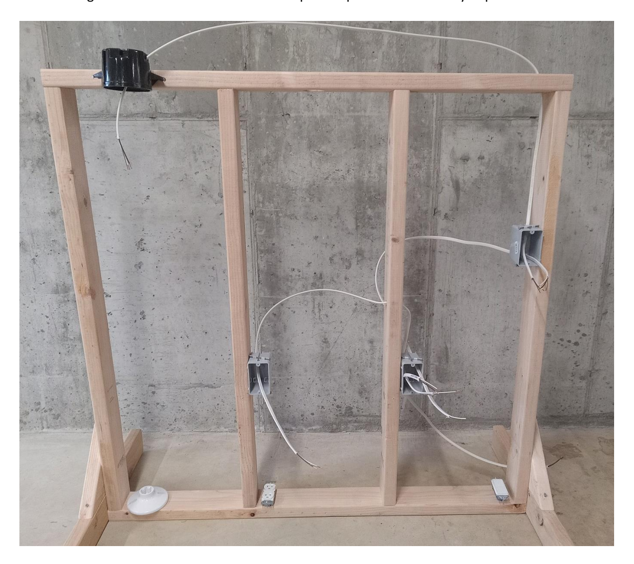
Figure 5. Wire Placement

Show the children Figure 1 and help them to identify the components in the completed system. Have them select the outlet, light switch and light fixture and place them near the appropriate junction box. Show them Figure 5 and instruct them to run the pre-cut pieces of wire that you provided as shown.