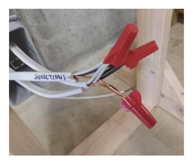
Figure 11. Connect the wires in the junction box

Finally instruct the children to connect the three black wires, the three white wires and the ground wires in the junction box using three wire nuts (Figure 11). Fit these inside the junction box and attach a cover plate.