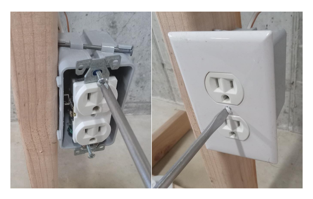
Figure 7. Secure the outlet and cover plate

Move on to the ceiling light fixture. Strip a total of \frac{3}{4} " insulation from the wires and help the children bend the wires into a hook, if this hasn't already been done. Attach the wires to the screw terminals. Secure the fixture in the junction box (Figure 8). Do not install the light bulb until all wiring in complete to minimize the risk of breaking it.