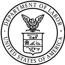
U.S. Department of Labor