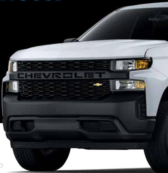
2021 Chevrolet Silverado 2500 HD Crew Cab LT