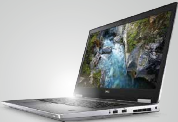
Dell Precision 7740

NAHB members save an extra 5% off select products.