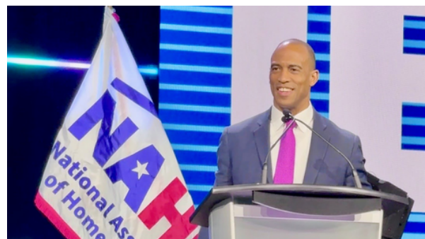
HUD Secretary Scott Turner addresses the NAHB Leadership Council at the 2025 International Builders' Show in Las Vegas.

Stay up to date on the latest legislative news and other key information at nahb.org/blog .