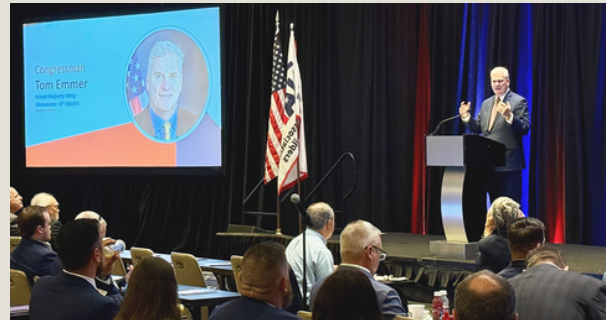
House Majority Whip Tom Emmer (R-Minn.) addresses NAHB members at the Legislative Conference.

More than 1,000 NAHB members trekked to Capitol Hill on June 11 for the 2025 Legislative Conference to urge their lawmakers to act on key policy areas that will help builders to increase the production of quality, affordable housing.